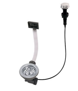
Automatic waste fitting 8407 100